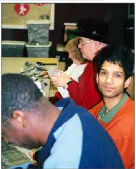
2004 Annual Report